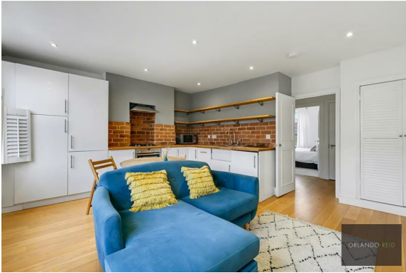
Battersea Park Road, SW11 Approximate Gross Internal Area = 442 sq ft / 41.1 sq m